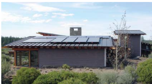
Solar electric and water heating systems produce half the electricity and heat all the hot water for this home near Bend, Oregon.

For example, a 2-kilowatt solar electric system valued at $17,000 would cost only $3,100 after the incentive and tax credits. The system would deliver free, reliable electricity for up to 40 years, shrink