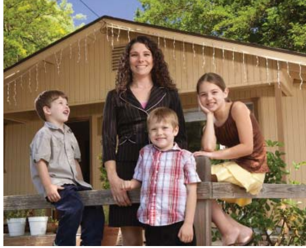
Before their home energy makeover, the Parkers lived with leaky windows, no insulation and an old heating system that wasted energy and money.

Before the makeover, a Home Performance with ENERGY STAR® assessment identified where the 1975 house was wasting energy. Contest sponsors donated products and services to make recommended upgrades that included insulation, air and duct sealing and high-efficiency windows, plus an energy-efficient heat pump and water heater. The makeover is expected to trim Parker's energy costs by as much as 50 percent.