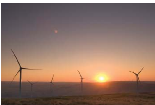
Goodhoe Hills wind facility near Goldendale, Washington

We’re building an increasingly sustainable energy supply and delivery business, which includes renewable energy generation. Our 2008 Integrated Resource Plan calls for acquiring an additional 1,400 megawatts of renewable resources by 2018.