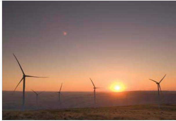
Goodnoe Hills wind facility near Goldendale, Washington

We're building an increasingly sustainable energy supply and delivery business, which includes renewable energy generation. Our 2008 Integrated Resource Plan calls for acquiring an additional 1,400 megawatts of renewable resources by 2018.