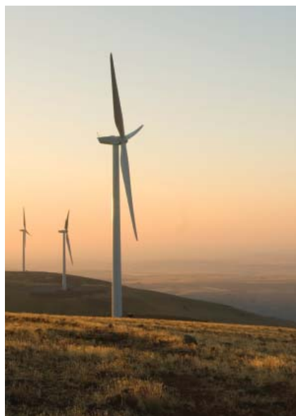
Goodnoe Hills wind facility near Goldendale, Washington

In addition, through our Green-e Energy Certified Blue Sky SM renewable energy program, we offer customers the opportunity to support new renewable resources