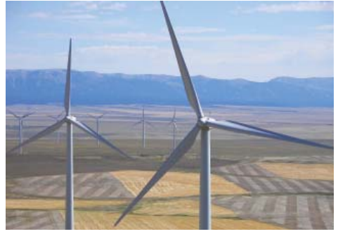
Judith Gap wind project, Harlowton, Montana

Pacific Power's Blue Sky green power option is Green-e Energy Certified, meeting environmental and consumer protection standards established by the Center for Resource Solutions. Blue Sky and other Green-e Energy Certified products are audited annually to