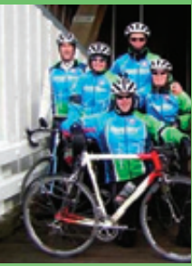
Willamette Valley Cycling team rides like the wind and shows their support for Blue Sky

Thanks to our new Blue Sky business partners, including: