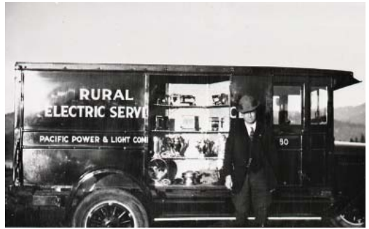
Pacific Power salesmen sold appliances door-to-door in the 1920s.

In 1927 the company sold 122 refrigerators, but by 1929 that number jumped to 902. Pacific Power salesmen touted that the electric refrigerator saved customers at least $3.54 a month in ice alone, not to mention the added convenience. The company later sold electric appliances in its retail stores.