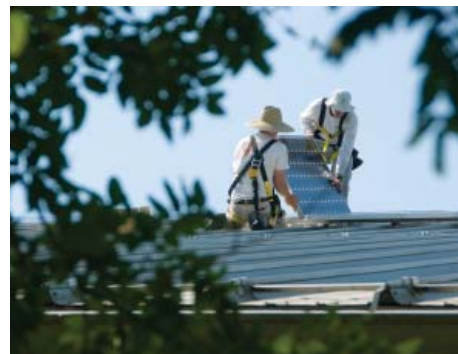
Blue Sky customer support helped develop 80 local renewable projects since 2006.

Blue Sky participants support wind energy in 100 kilowatt-hour increments, called blocks, for $1.95 each, in addition to their monthly bills. You can buy one or several blocks. In turn, we buy renewable energy certificates on your behalf equal to your purchase and also