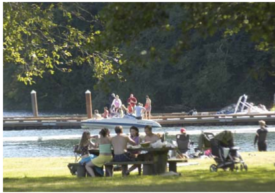
Thousands enjoy Pacific Power recreation sites each year.

In many states it's illegal to transport these invasive species. When boating or fishing, make sure you're not inadvertently