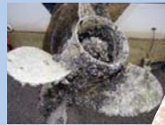
Quagga mussel (actual size)