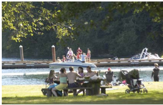
Thousands enjoy Pacific Power recreation sites each year.

In many states it's illegal to transport these invasive species. When boating or fishing, make sure