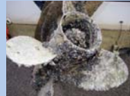
Quagga mussel (actual size)