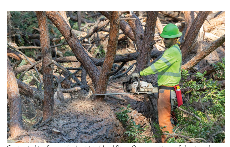
Contracted professional arborist in Hood River, Oregon cutting a fallen tree during vegetation management activities