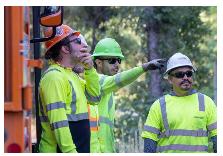
Contracted professional arborist in Hood River, Oregon surveying trees and underlying vegetation in preparation for clearing and maintenance.