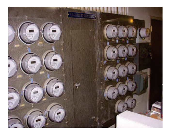
Figure 3 — Ganged Meter Socket